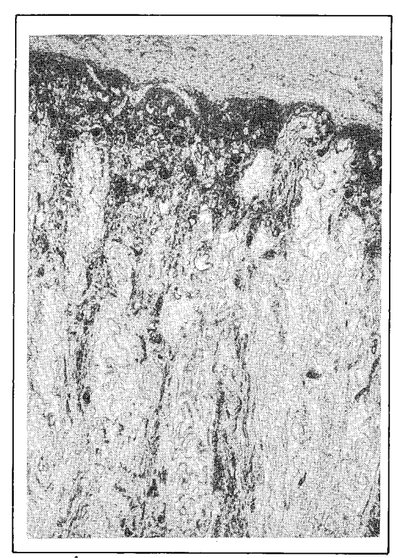
Fig. 3 Section of the kidney showing enormously dilated collecting tubules lined by cuboidal and flattened epithelial cells (x 250).

chances of delivering a normal baby is low. Both the parents were counselled regarding this and told to come for early antenatal care if they decide to embark on any future pregnancies. Serial ultrasonographic examinations could detect any recurrence of either condition and would be useful in managing the pregnancy.