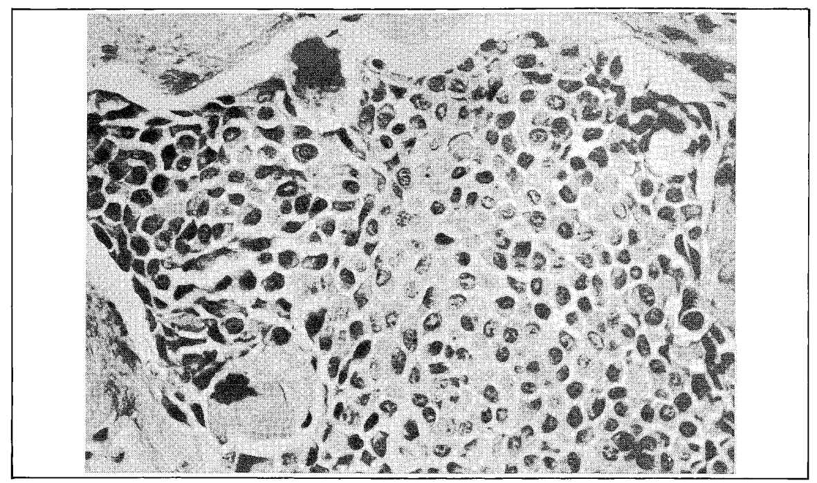
Fig. 1 Pleomorphic adenoma – sheets of hyaline cells showing the plasmacytoid appearance and lack of cohesion. (Haematoxylin and eosin. Original magnification x 300.)