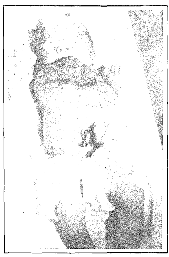
Fig. 1 Before operation, appearance of patient with hemangioma over the anterior chest wall.

and there was no murmur. The breath sounds were vesicular and equal in both lungs. The liver was 2.5 cm palpable below the right costal margin at the mid clavicular line. Other systems were normal.