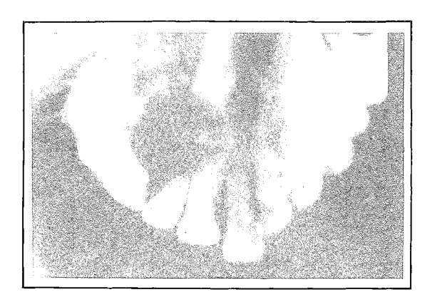
Fig. 1 Radiograph showing a multilocular radioluscency in the right anterior maxilla.

Radiographically, the lesions present as either a unilocular radioluscency or a multilocular radioluscency (Fig. 1). Bucco-lingual expansions of the mandible were evident in many cases. Root resorptions of adjacent teeth were also common features.