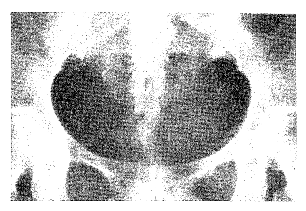
Fig. 1 Pelvic radiograph showing linear foreign body.

There are a variety of methods for extracting an IUCD with missing tails.<sup>2</sup> In our experience, most of these cases are due to retracted tails rather than uterine perforation, and it is easy to retrieve such devices using the Karman suction cannula.<sup>2</sup> However, this method was considered unsuitable in this woman