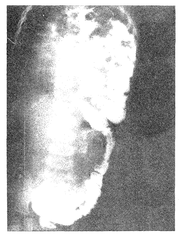
Fig. 3 Barium meal in a one-and-a-half-year-old boy with left diaphragmatic hernia.

one had a right-sided hernia. One left-sided hernia had the barium study done elsewhere.