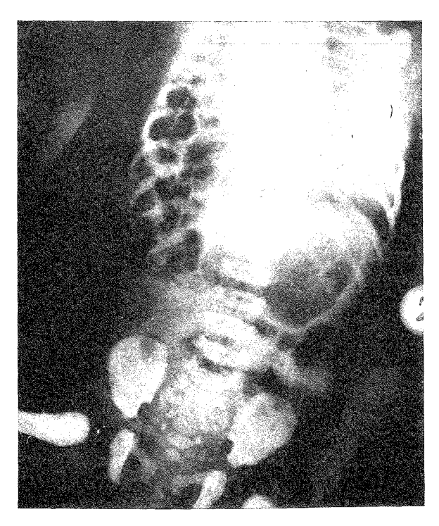
Fig. 1 Features noted in 24 cases of Bochdalek Hernias. Fig. 2(b) Right-sided posterolateral diaphragmatic hernia.