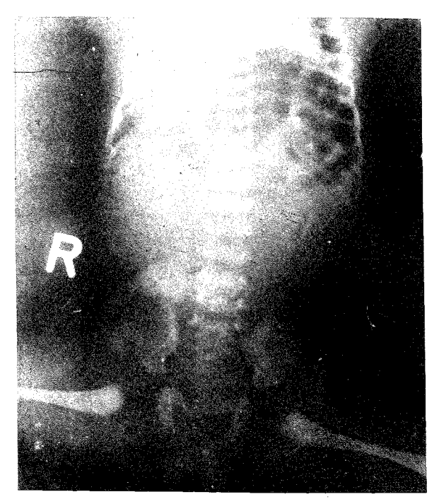
Fig. 2(a) Left-sided posterolateral diaphragmatic hernia. Note a paucity of gas shadows in abdomen and shift of mediastinum.