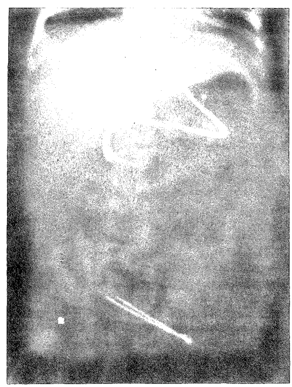
Fig. 2 Confirmation of the duodenal tube's position through fluoroscopy.

Before use, the catheter is immersed in 1% chlorhexidine solution, then washed and rinsed with hot water shortly before introduction. The patient who has been sedated with chloral hydrate (30 mg/kg) orally an hour before is given 1 mg Maxolon intramuscularly shortly before introduction. The expanded end of the catheter is advanced via the oral route and negotiated through the pylorus to lodge between the second and third part of the duodenum. The position is confirmed on fluoroscopy (Fig. 2). The other end of the catheter is strapped with plasters around the mouth. The process may take anything from 15