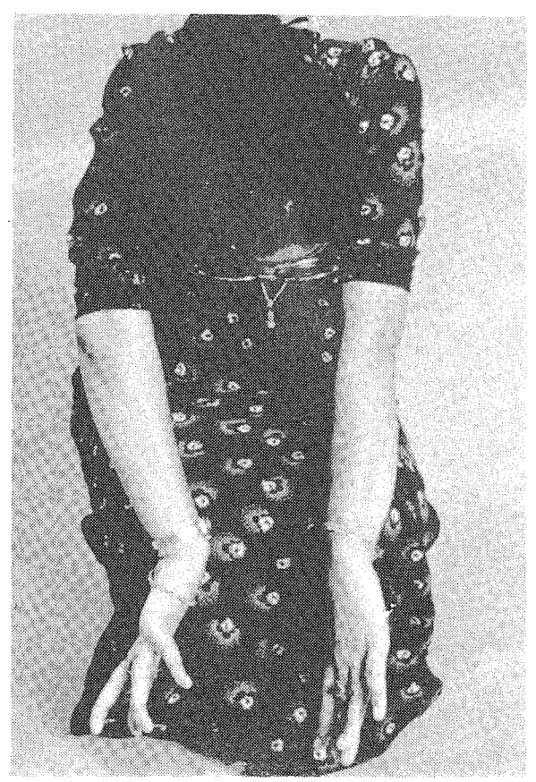
Fig. 3 Patient straining to abort an attack.

On examination she appeared normal. BP 120/80 mmHg, PR 76/min. No Kayser Fleisher ring noted. Systemic and neurological examination were normal. Blood counts were normal and L.E. cell was negative. Serum caeruloplasmin and 24 hour urine copper were normal. Skull X-Rays, EEG, radioisotope brain scan and CAT scan of brain were normal. She was treated with phenobarbitone 30 mg three times per day with complete control of symptoms.