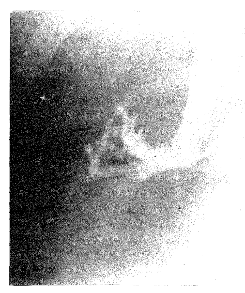
Fig. 2 Selective right renal venogram showing normal upper pole veins and thrombosis of the lower pole veins.

urography (Fig. 1) disclosed a faint bilateral nephrogram throughout the period of examination. The kidneys were enlarged and smooth in outline, the right kidney measuring 14.5 cm and the left kidney measuring 15.0 cm.