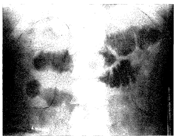
Fig. 1 IVU showing a faint nephrogram with bilaterally enlarged kidneys.