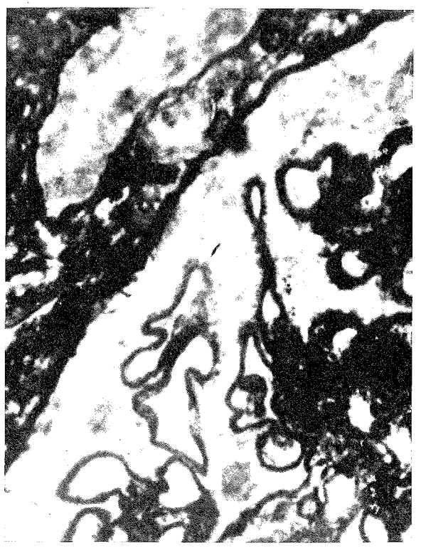
Fig. 5 Part of the glomerula tuft showing typical 'spikes' (Jones' methenamine silver x3200).

In intravenous urography, the kidney will appear