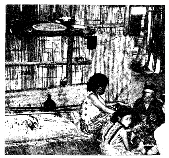
Fig. 3 The interior of a Murut longhouse showing the kitchen and hearth and householders preparing a meal of fern shoots.

education which is perhaps the single most important preventive measure as far as poverty and malnutrition are concerned. In the long run, education will be one of the most valuable assets in the prevention of malnutrition among the Muruts of Sabah.