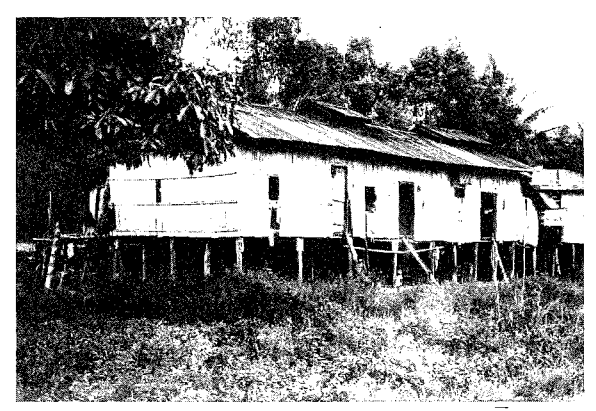
Fig. 1 A Murut longhouse in Kampung Ansip, Keningau.

detailed ecological study to determine the interplay of various factors in the causation of malnutrition among the Muruts. Detailed enquiries were made into what foods were eaten as well as into the various traditional beliefs and food taboos followed by the people. Dietary patterns, food production, distribution and availability were also noted and enquiries into the socio-economic status of each household were also made.