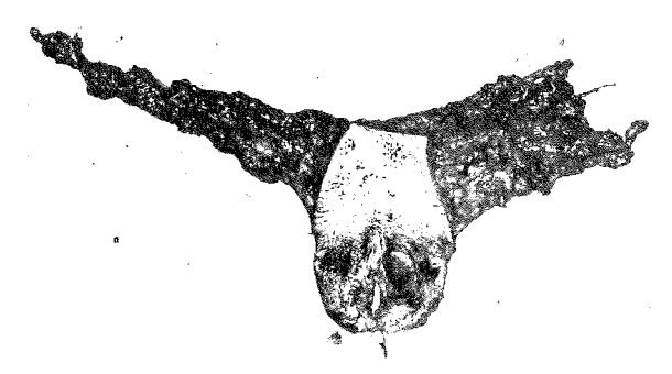
Fig. 3 The excised operative specimen with attached inguinal and femoral lymph nodes removed enbloc.

and joined posteriorly by a transverse incision just anterior to the anal margin. The vaginal incision is made circumferentially just within the mucocutaneous junction. The entire mass that has been dissected earlier is now swung downwards and excised completely with the vulva and lymph channels, nodes and surrounding fat in continuity. The vulval skin and vaginal mucosa are sutured with interrupted chromic catgut while the skin in the mons is sutured with interrupted mersilk sutures.