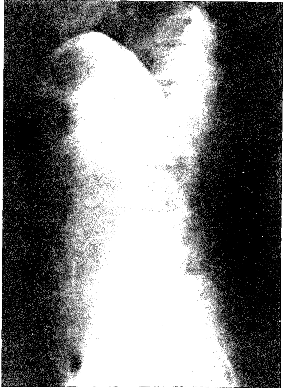
Fig. 3 Lateral x-ray abdomen - The device is at the level of the fifth lumbar vertebra on standing.

A 29-year-old Indian housewife, para 3, had a lower segment Caesarean section done in 1976. A Lippes loop was inserted one month after delivery of her second child in 1978. She became pregnant one month later and delivered a male baby at term in 1979. The device was