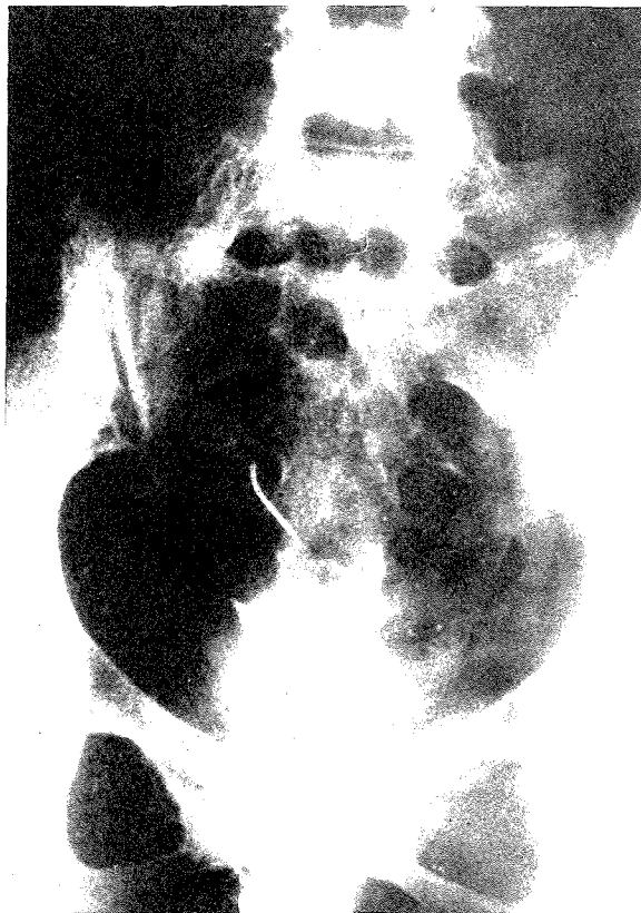
Fig. 1 Hysterosalpingogram - note the extra-uterine position of the Copper-7 device.

A 27-year-old Chinese female, para 4, had a Copper-7 device inserted at the University Hospital. Insertion was easy. Four months later at a routine follow-up visit, examination showed that the nylon thread was not visible. X-ray abdomen showed the device to be still in the pelvis and probably within the uterus. Dilatation and curettage did not reveal the presence of an intra-uterine device. Translocation was diagnosed and confirmed by hystero-salpingogram (Fig. 1). At laparoscopy the device was found to be embedded within the omentum. The uterus was normal with no evidence of perforation. There was difficulty in freeing the device from the omentum and this was delivered through the widened