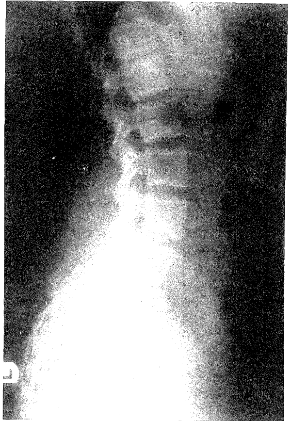
Fig. 5 Lateral x-ray abdomen - shows the Copper T device outside the uterus but within the pelvis.

The device was removed and the uterine perforation repaired. The patient was not keen on having a tubal ligation and she was discharged a week later with oral contraceptives.