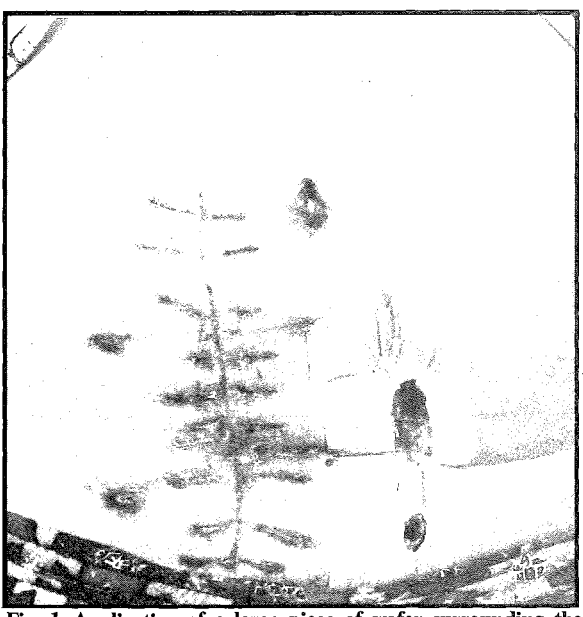
Fig. 1. Application of a large piece of wafer surrounding the entero-cutaneous fistula to prevent skin exceriation.