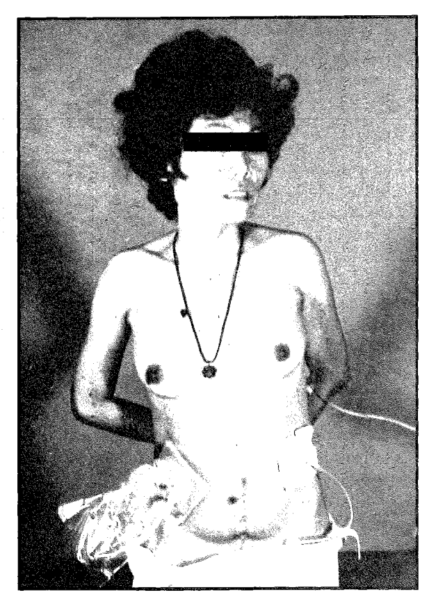
Fig. 3. The use of a stoma-adhesive and bag for collection of discharging fluid from an entero-cutaneous fistula.