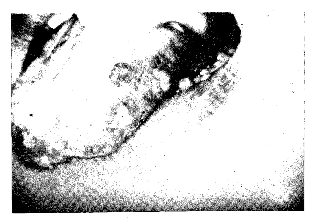
FIGURE 3 — Shows herpetiform ulcers on the tongue.

In a series of 85 patients examined by Oshima et al. (1963), 36 had the classical triad and the remaining 49 were partially affected. Oral ulcera-