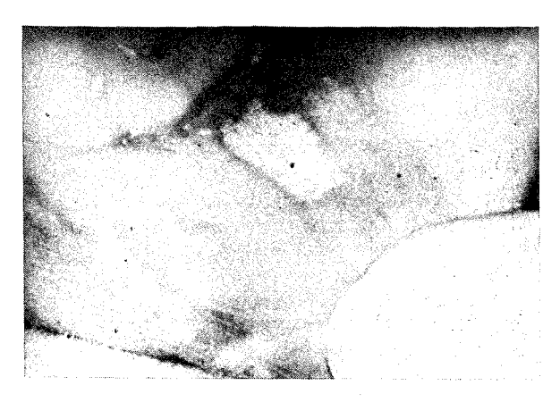
FIGURE 1 — Shows a minor aphthous ulcer on the lower lip.

(4 to 20 days). After a variable period of time the ulcers heal spontaneously without obvious scar formation. It is interesting to note for comparison that a single small traumatic ulcer of