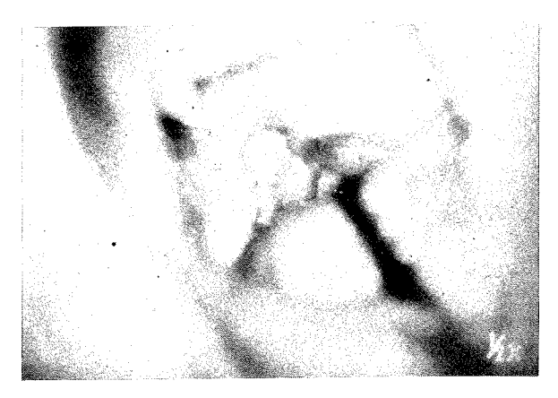
FIGURE 2 — Shows a major aphthous ulcer on the right side of the soft palate with evidence of severe scarring.